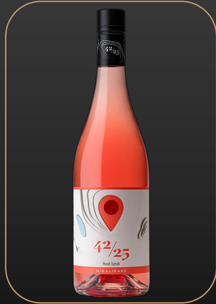
42/25 Rose Syrah