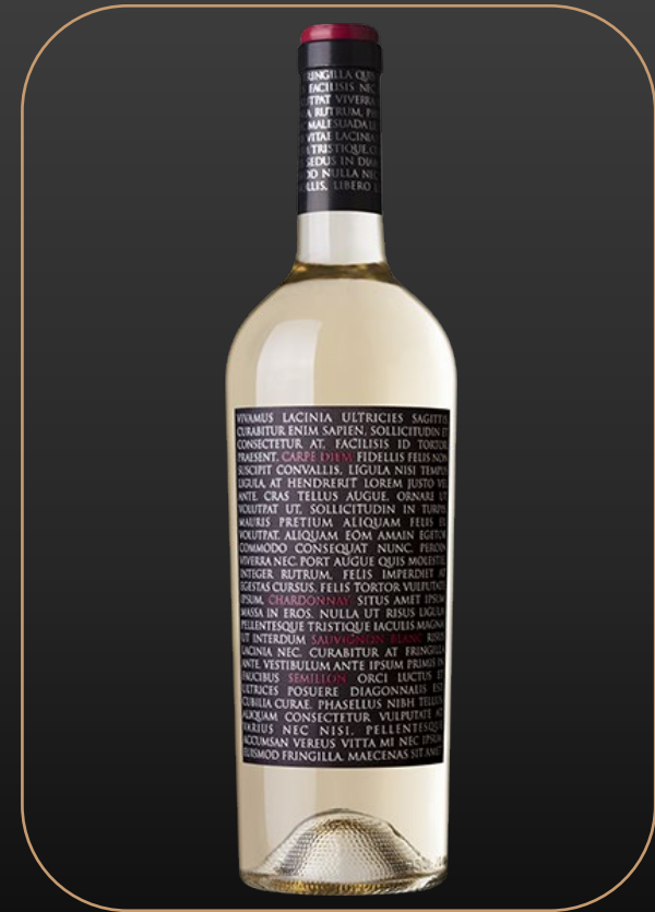
Carpe Diem White