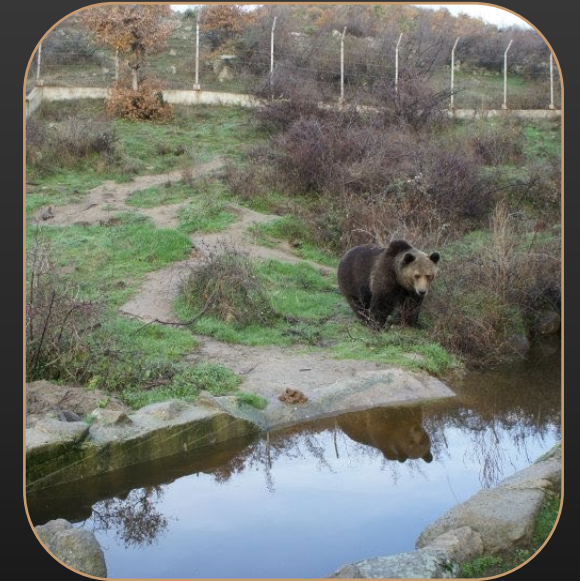
Let's build a new home for the bear Rosa