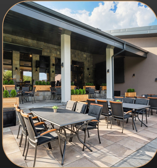
Midalidare Gastro Pub