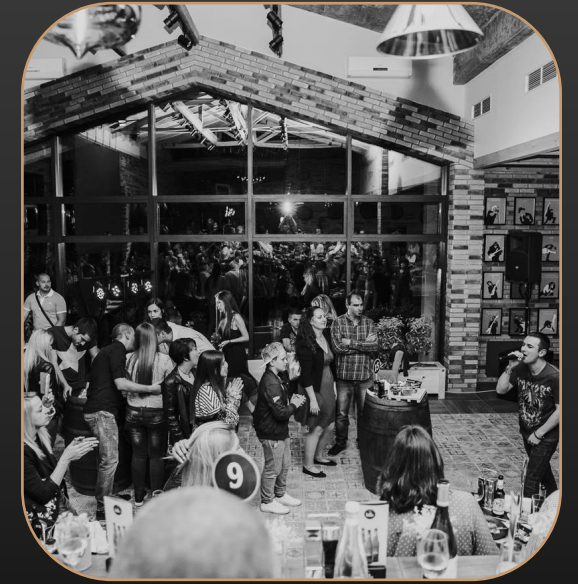
Live music events