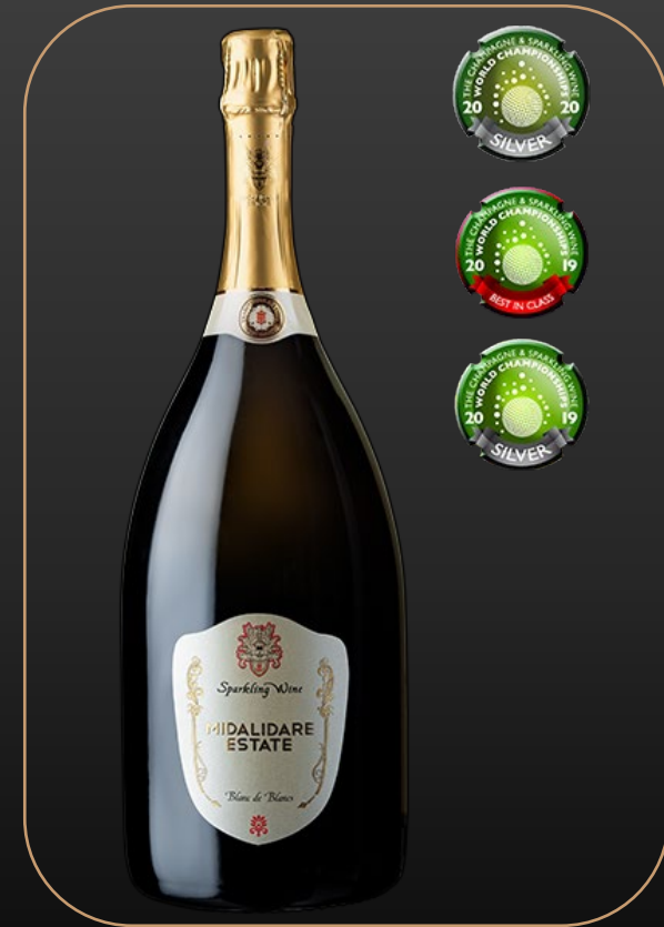
Midalidare Sparkling Blanc de Blancs Brut Magnum