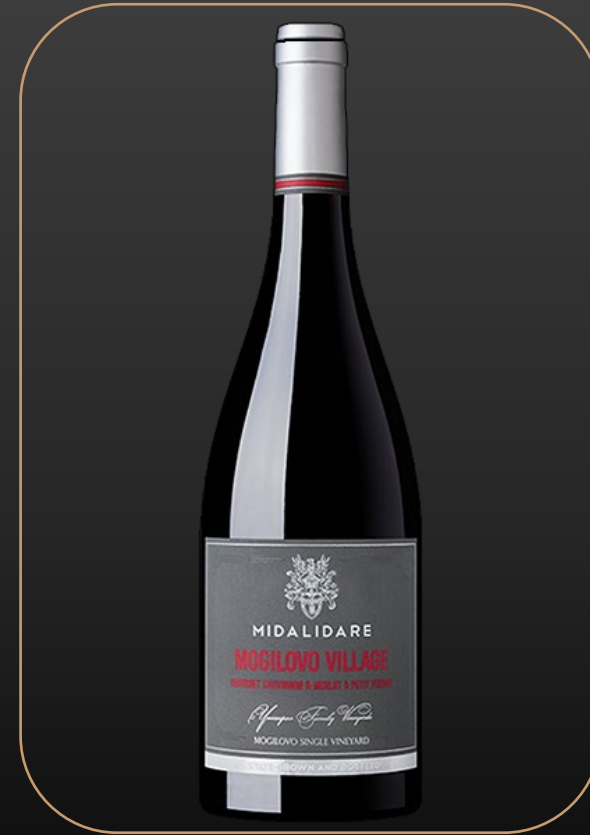
Mogilovo Village Cabernet & Merlot & Petit Verdot