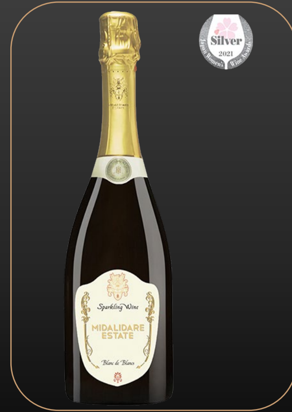
Midalidare Sparkling Blanc de Blancs Brut