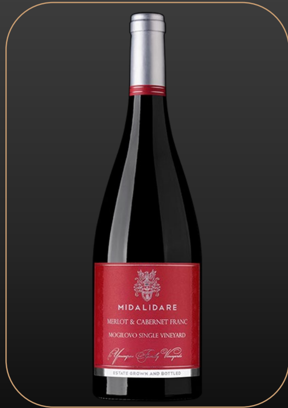
Midaldare Merlot & Cabernet Franc Regular & Half