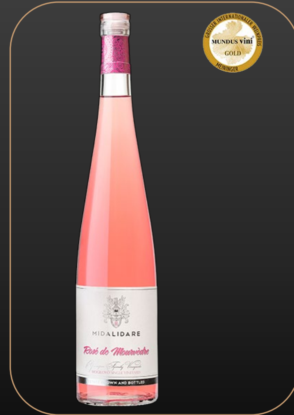
Rose de Mourvedre Regular & Half