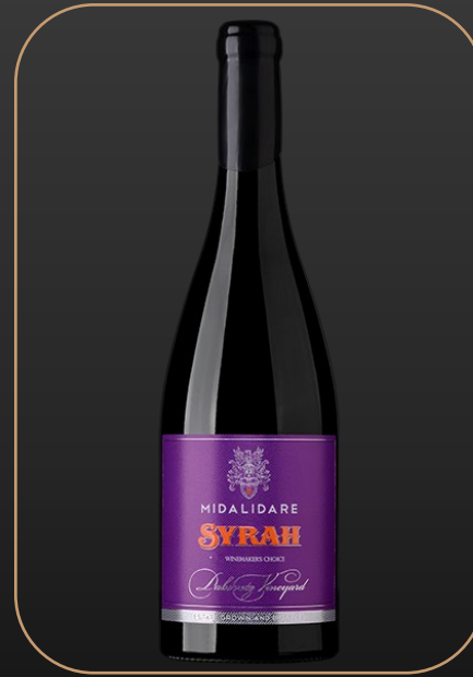
Winemaker's Choice Syrah