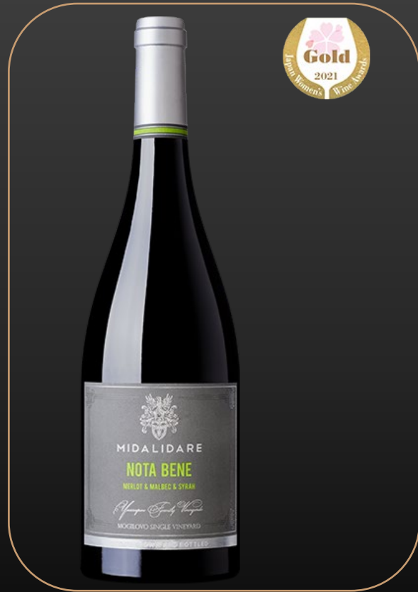
Nota Bene Merlot & Malbec & Syrah Regular & Half