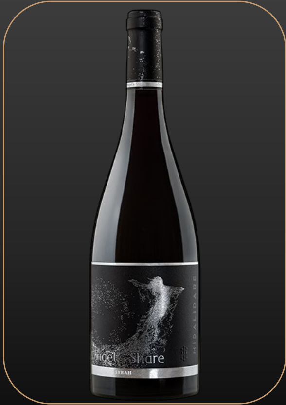
Angel's Share Syrah Regular & Half