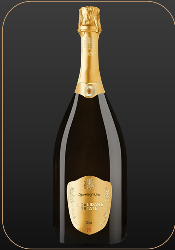
Midalidare Sparkling Gold Extra Brut Magnum