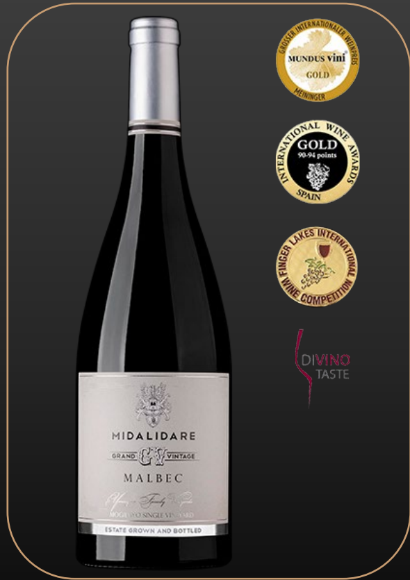
Grand Vintage Malbec Regular & Magnum