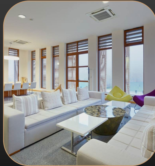
Estate Guest House