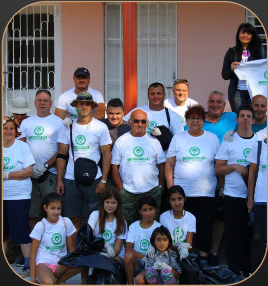
Let's clean Bulgaria together