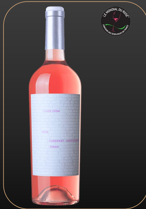
Carpe Diem Rose