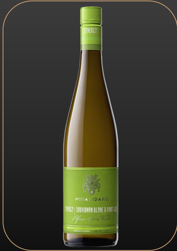
Synergy Sauvignon Blanc & Pinot Gris