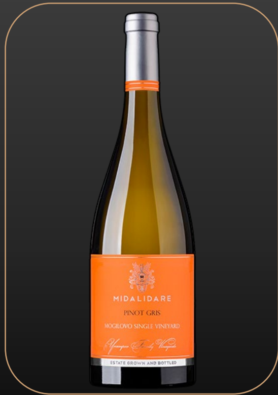
Midalidare Pinot Gris