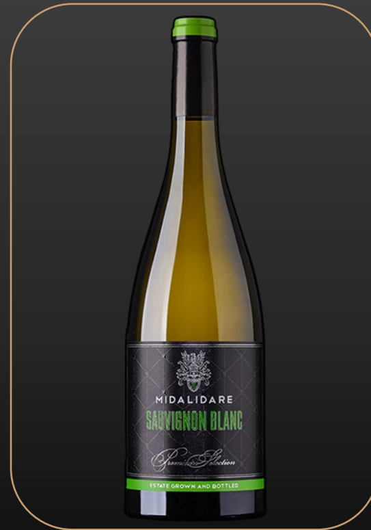
Sauvignon Blanc Premium Selection