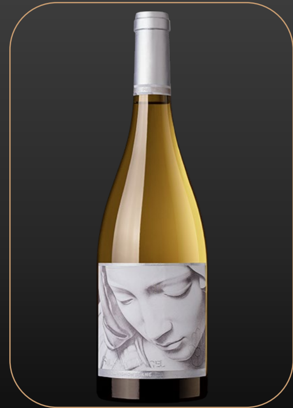
Silver Angel Sauvignon Blanc Regular & Half