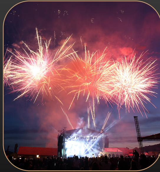
Midalidare Rock In The Wine Valley