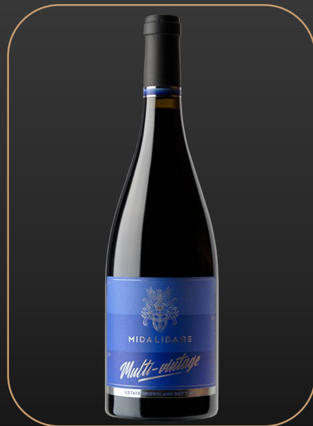
Midalidare Multi- vintage