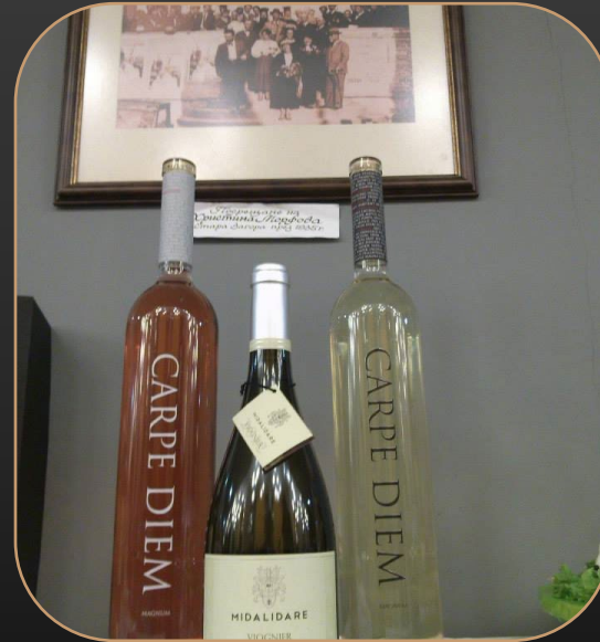
Charity "Christmas Eve for the Opera"