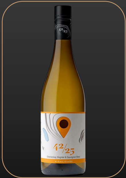
42/25 Chardonnay & Viognier & Sauvignon Blanc