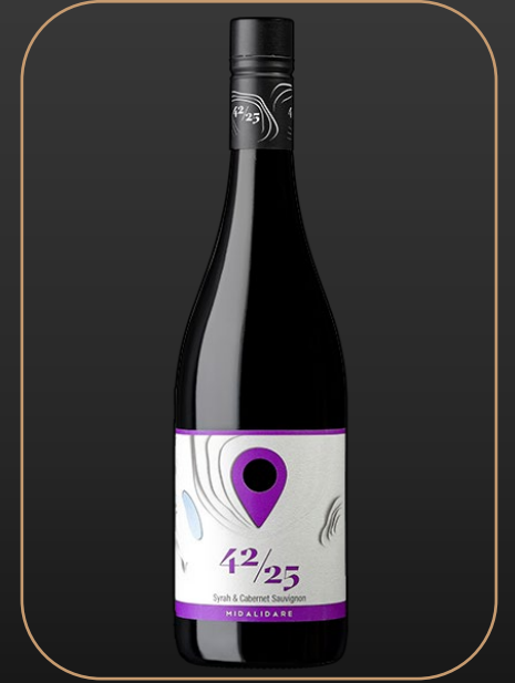
42/25 Syrah & Cabernet Sauvignon