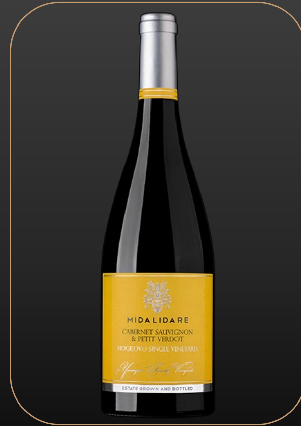
Midaldare Cabernet Sauvignon & Petit Verdot Regular & Half