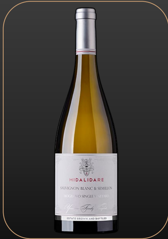
Midalidare Sauvignon Blanc & Semillon