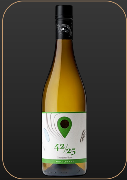
42/25 Sauvignon Blanc