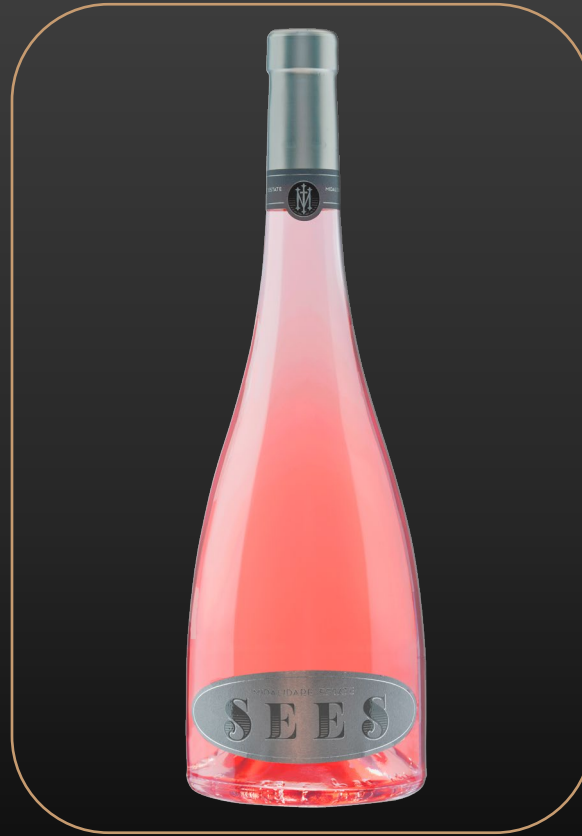
SeeS Rose Cabernet Sauvignon & Cabernet Franc