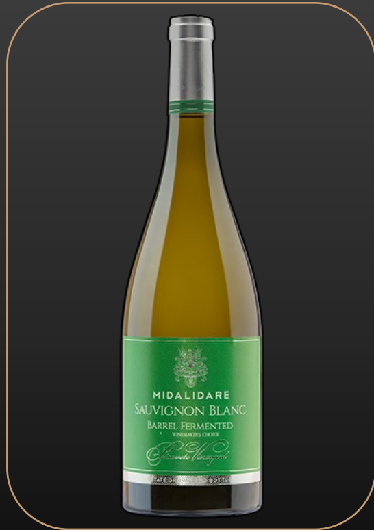
Winemaker's Choice Sauvignon Blanc