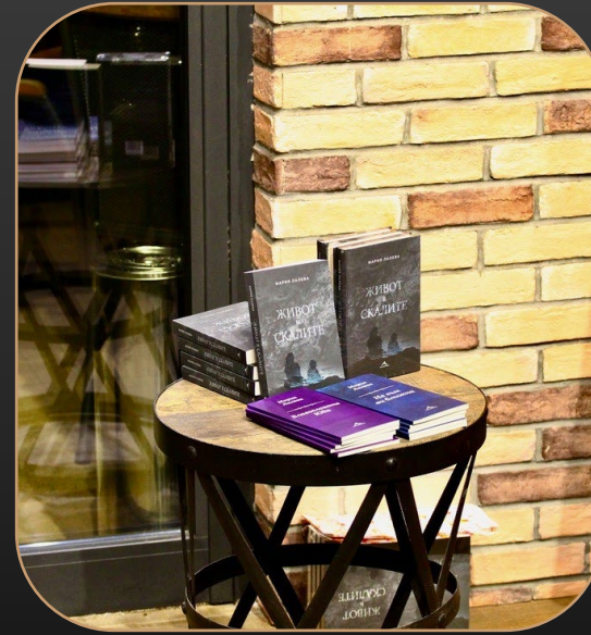
Wine and Book