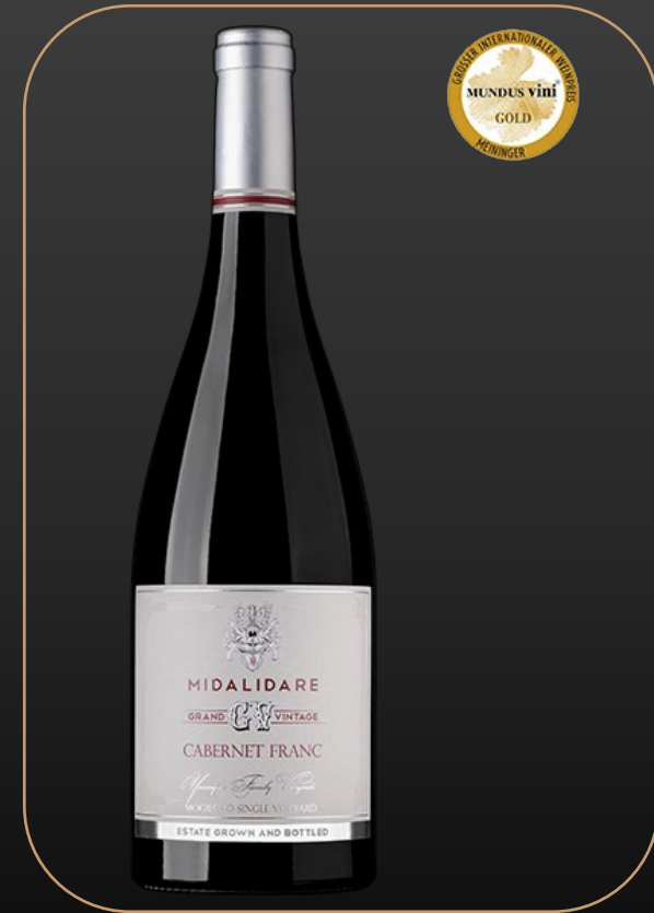
Grand Vintage Cabernet Franc Regular & Magnum