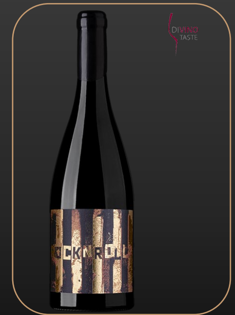
Rock'NRolla Regular & Magnum