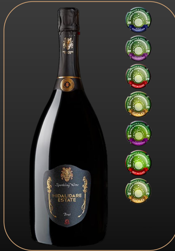
Midalidare Sparkling Brut Magnum