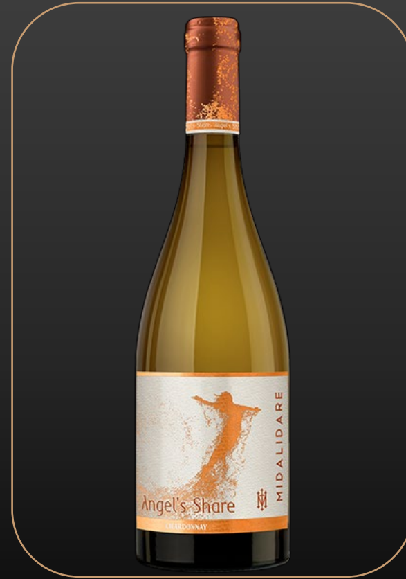
Angel's Share Chardonnay Regular & Half