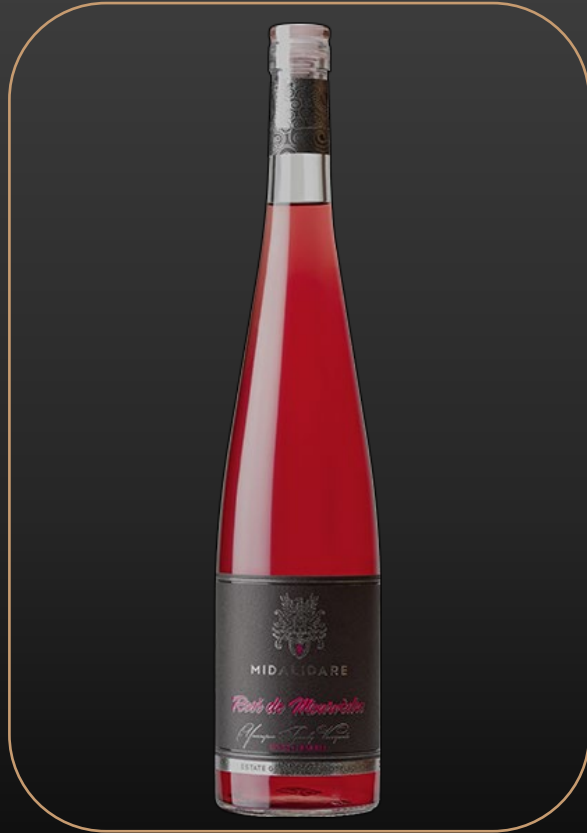
Rose de Mourvedre Singe Barrel