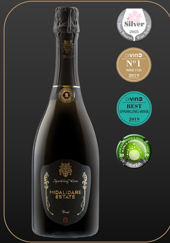
Midalidare Sparkling Brut