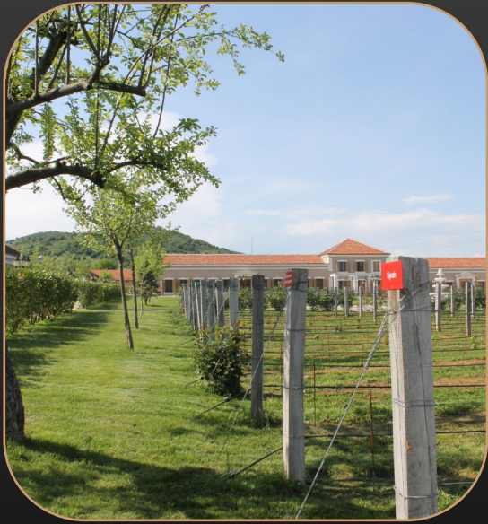
Library of varieties