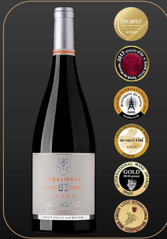
Grand Vintage Syrah Regular & Magnum