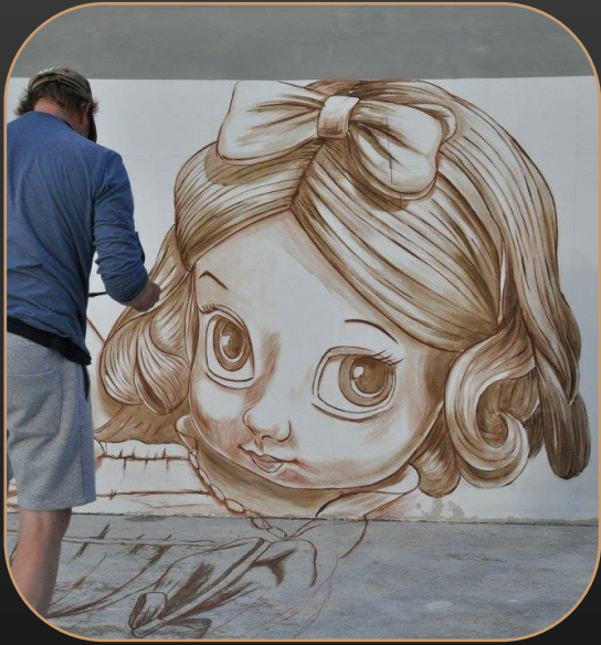
International 3D Street painting festival