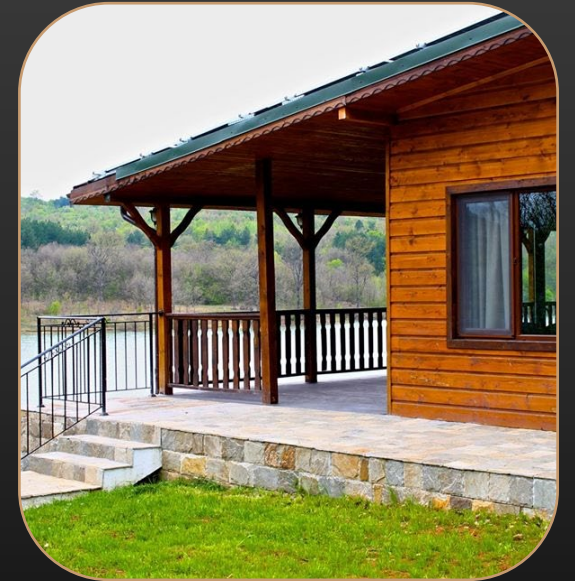
Mogilovo Dam Chalets