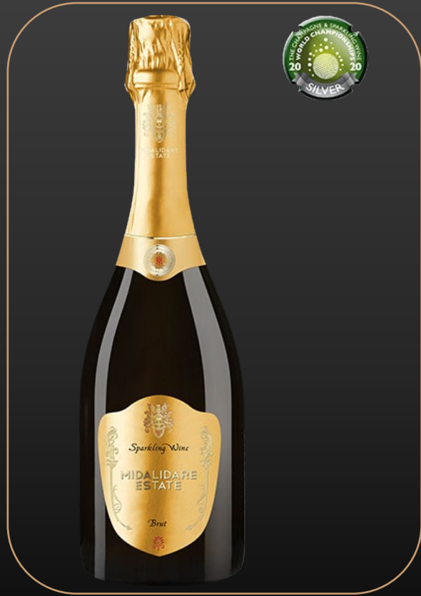
Midalidare Sparkling Gold Extra Brut