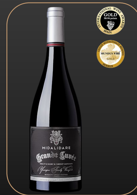
Grande Cuvee Regular & Magnum