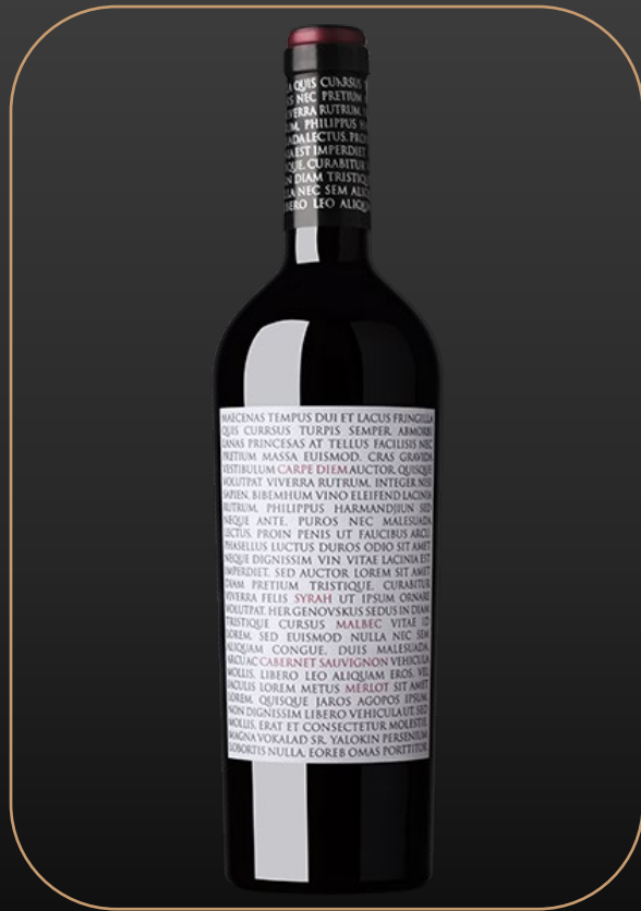
Carpe Diem Red